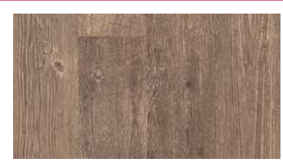
Bluegrass Barnwood Beige Ballad