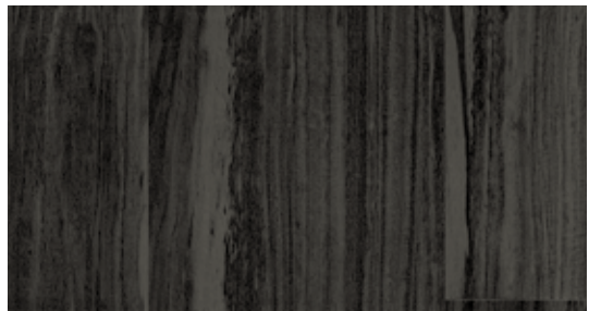
Goncalo Aves Onyx