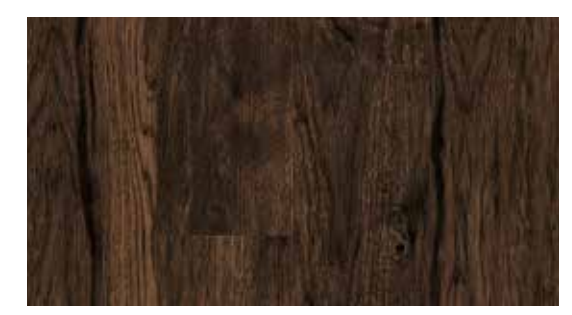
Hickory Point Copper Penny