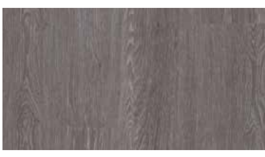
Charlestown Oak Platinum