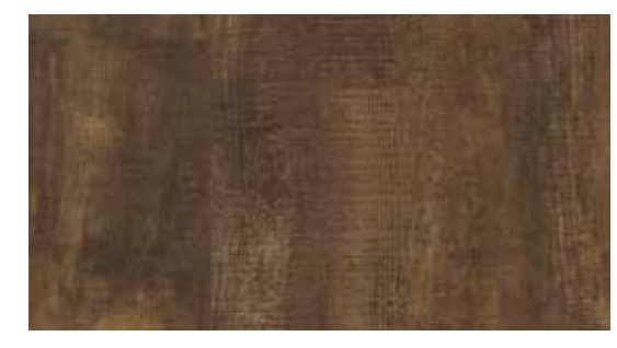
Homespun Harmony Down to Earth