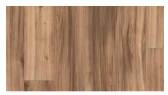
Arbor Orchard Natural