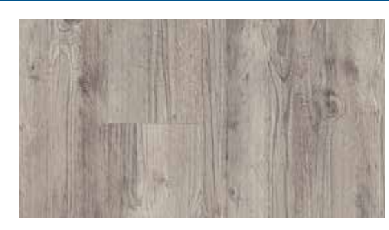
Century Barnwood Weathered Gray