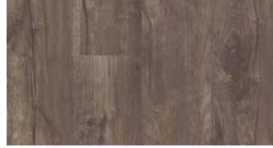
Gallery Oak Chestnut