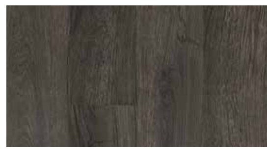
Vintage Timber Charcoal