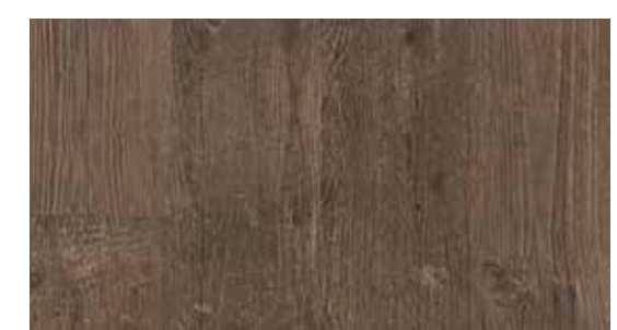
Bluegrass Barnwood Fiddle Brown