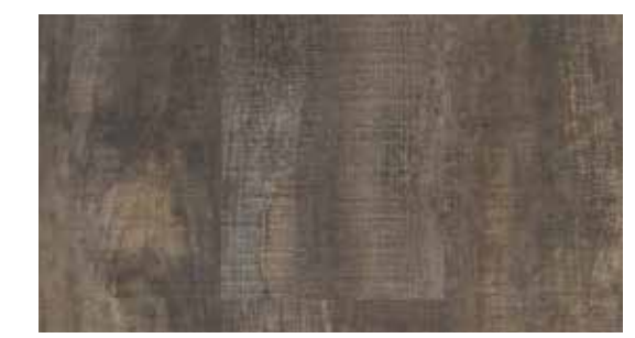
Homespun Harmony Rugged Brown