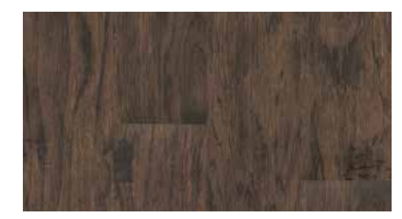
Wabash Hickory Tavern Brown