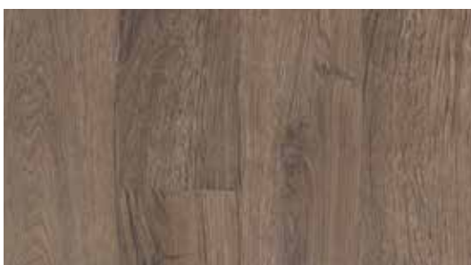
Vintage Timber Patina