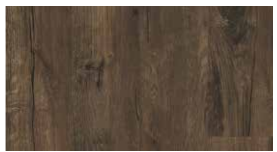
Gallery Oak Cocoa