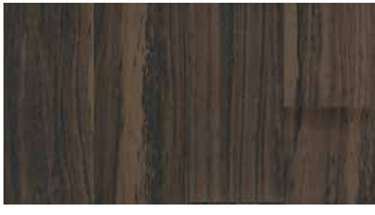
Goncalo Aves Espresso