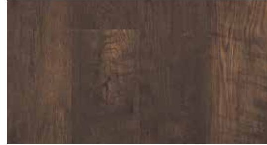
Rural Reclaimed Russet