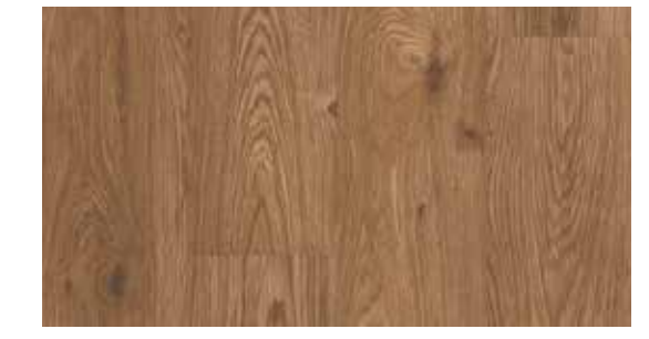
Weston Oak Golden Glaze