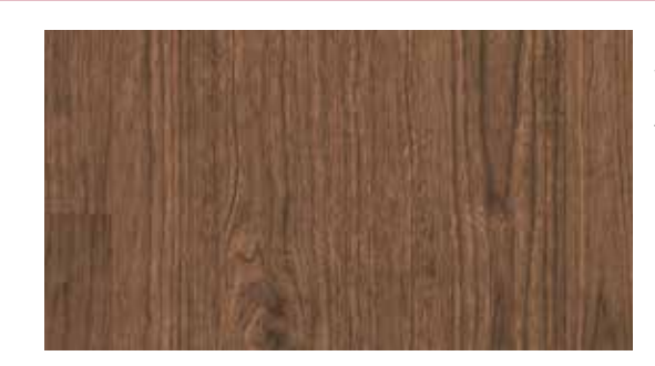
Walnut Cove Antique Brown

Available in two installation options: Glue Down / IntegriLock™ System