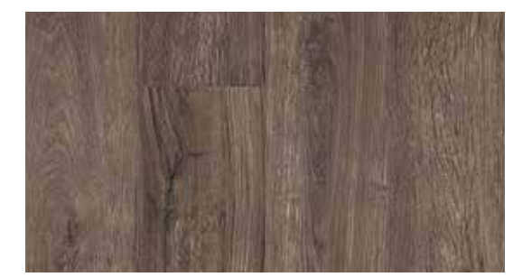
Vintage Timber Timberwolf