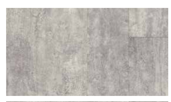
Cinder Forest Gray Allusion

Available in two installation options: Glue Down / IntegriLock™ System