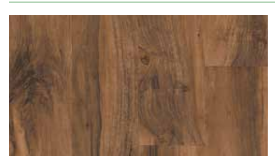
Kingston Walnut Clove

Available in two installation options: Glue Down / IntegriLock™ System