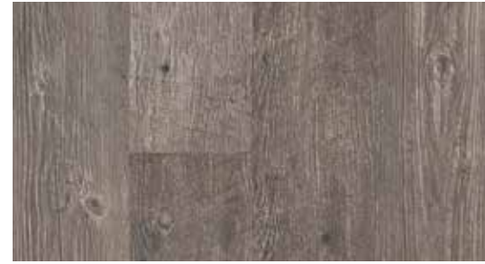
Bluegrass Barnwood Rustic Harmony