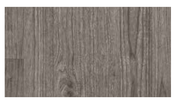
Walnut Cove Ash