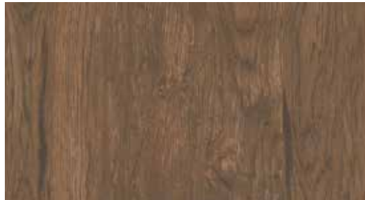
Hickory Point Palomino Pony