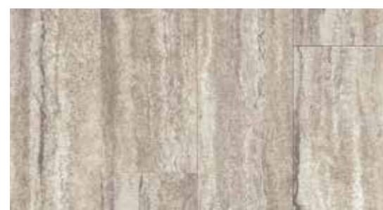
Messenia Travertine Antiquity