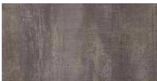
Homespun Harmony Galvanized Gray