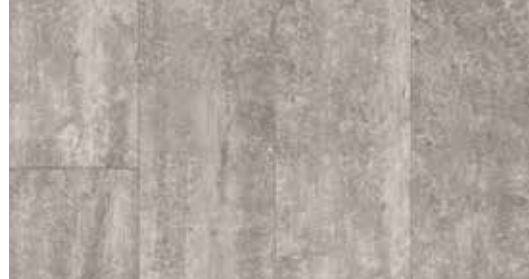
Cinder Forest Beige Breeze