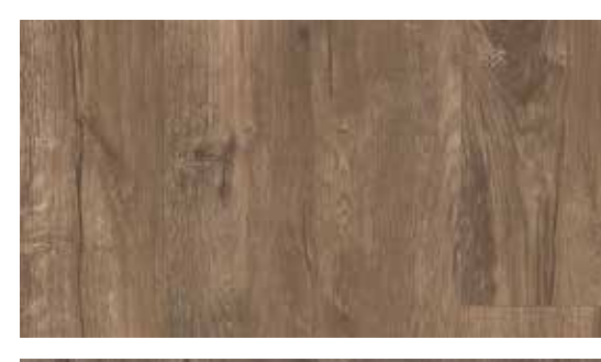
Gallery Oak Corn Husk