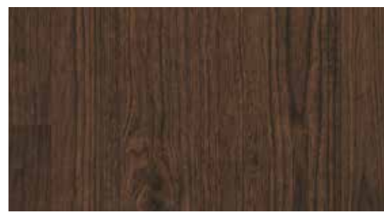
Walnut Cove Dark Chocolate