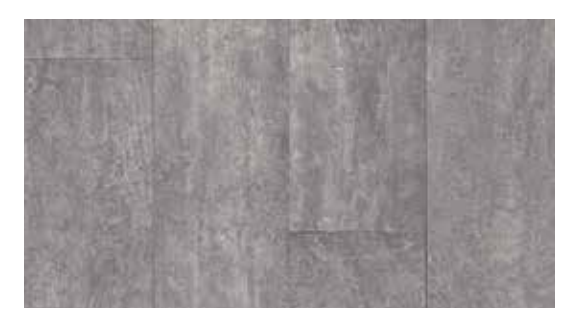
Cinder Forest Cosmic Gray