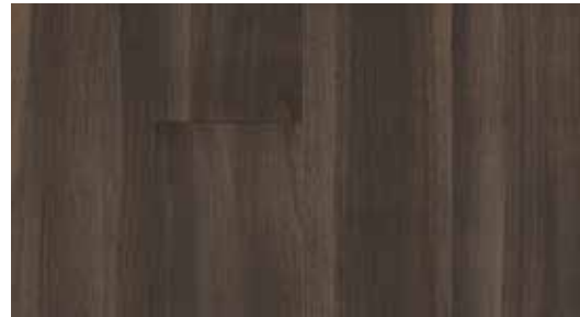
West Side Walnut Bistro Brown