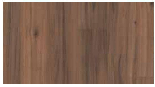
Arbor Orchard Apple Cider