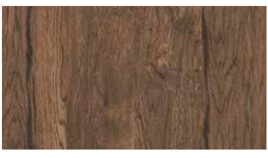
Hickory Point Roasted Pecan U3030/U4030