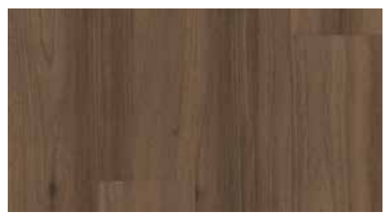
West Side Walnut Underground Brown