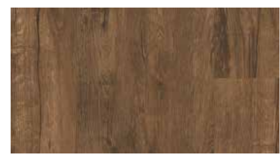
Gallery Oak Cinnamon