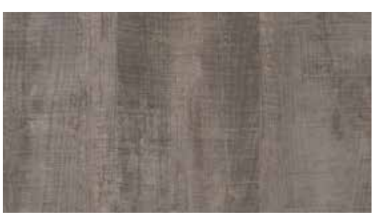
Homespun Harmony Natural Burlap

Available in two installation options: Glue Down / IntegriLock™ System