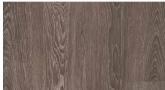
Charlestown Oak Mocha