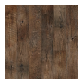
DOCKSIDE Boardwalk - MAX033