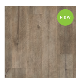
LAKEVIEW Treeline - MAX093