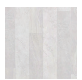
MERIDIAN Porcelain Plank - MAX020 Rectangle - MAR020

A weathered concrete look with an upscale urban feel, Meridian has a textured surface that mixes light and texture with impressive detail. It is available in 12" \times 24" rectangles as well as 6" \times 48" planks.