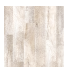
SEAPORT Surf - MAX040