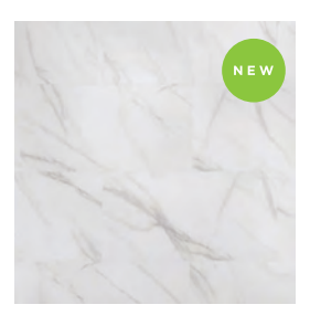
LEGACY White with Gray MAR120