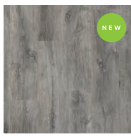
ASPEN Drift - MAX081