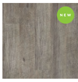
LAKEVIEW Dry Timber - MAX091 Cabin - MAX092