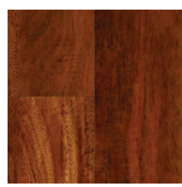
ACACIA Tiger's Eye - MAXO11