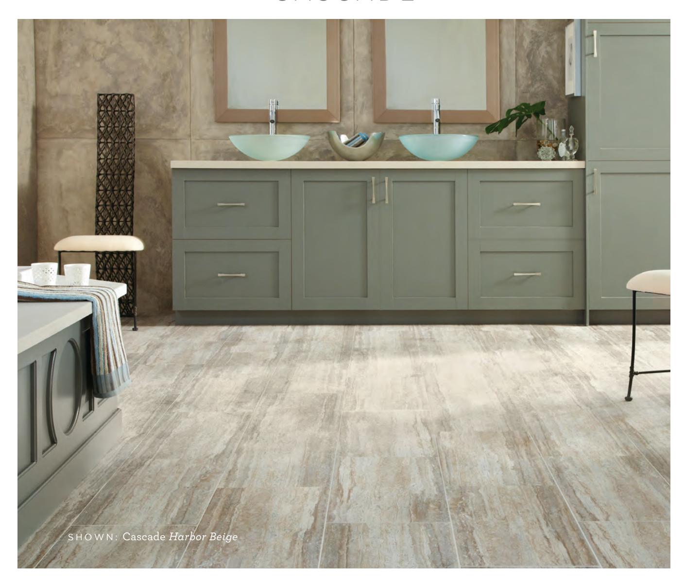
A stunning travertine look in a 12" x 24" rectangle. Cascade has dramatic color variation and realistic detail.