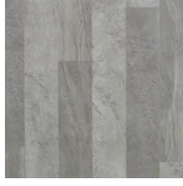
MERIDIAN Steel Plank - MAXO22 Rectangle - MARO22