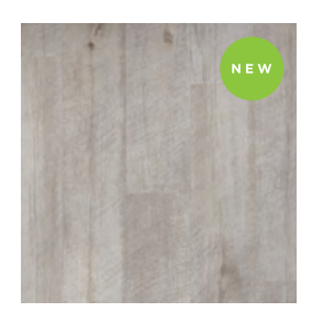
LAKEVIEW Rapid - MAX090