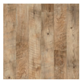
DOCKSIDE Sand - MAX031