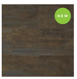
GRAFFITI Patina - MAR101