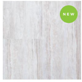
CASCADE Sea Mist MAR111