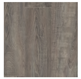
SAUSALITO Bay Breeze-MAX070

A rustic oak with refined wire brushing and realistic saw marks. Sausalito captures the seaside chic vibe of the California coastal city for which it is named.