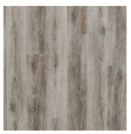
MARGATE OAK Waterfront - MAX051