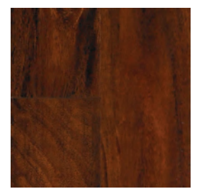
ACACIA African Sunset -MAX010