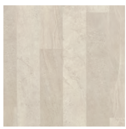
MERIDIAN Stucco Plank - MAXO21 Rectangle - MARO21