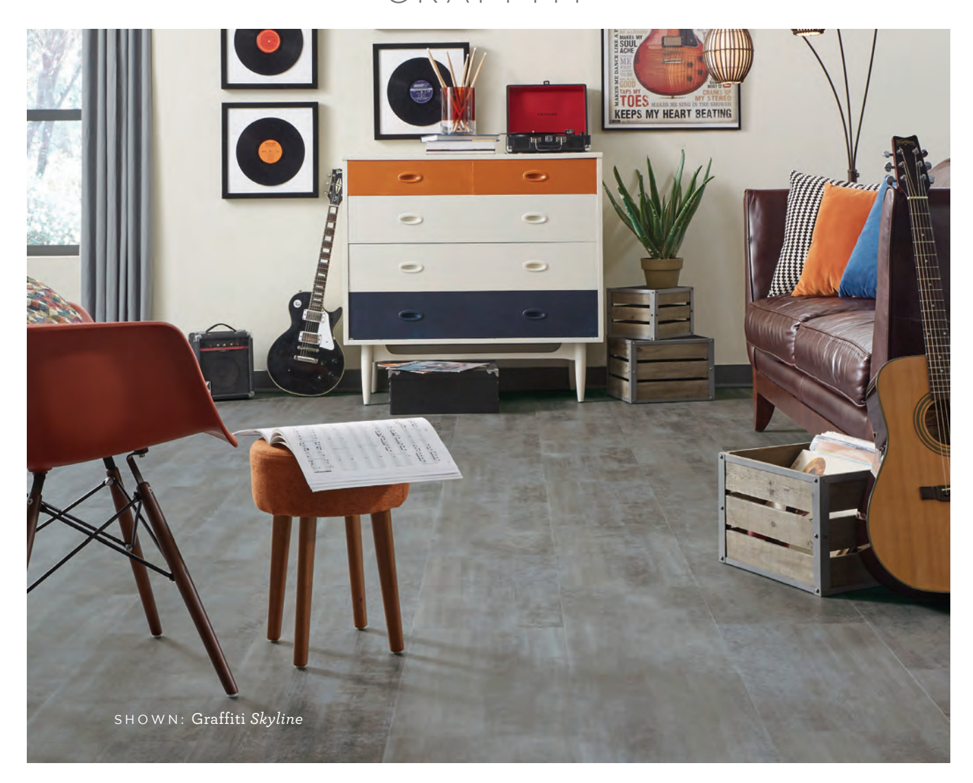
Graffiti is a 12"x24" rectangle inspired by urban street art and culture, focusing on a hip - yet haute - concrete look created by a colorful collage of blended hues.