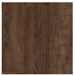
SAUSALITO Sunrise - MAX071