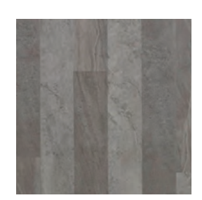
MERIDIAN Carbon Plank - MAXO23 Rectangle - MARO23