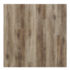
MARGATE OAK Harbor - MAX052