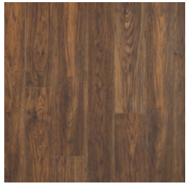
SUNDANCE Gunstock - MAX001