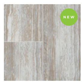
CASCADE Harbor Beige MAR110