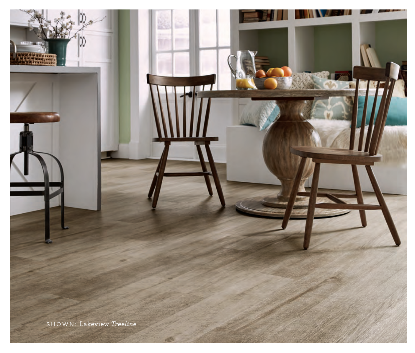
A time-weathered hardwood plank look that works well in a range of settings from traditional to contemporary to cottage, Lakeview has realistic surface texture and exceptional detail.