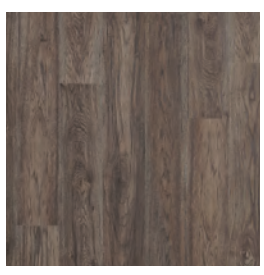
SUNDANCE Smoke - MAX003