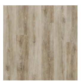
MARGATE OAK Coastline - MAX050