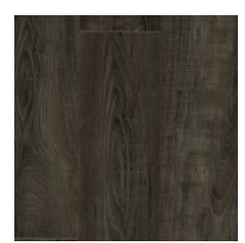
SAUSALITO Waterfront - MAX072 Bridgeway - MAX073