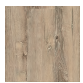
NAPA Dry Cork - MAX060