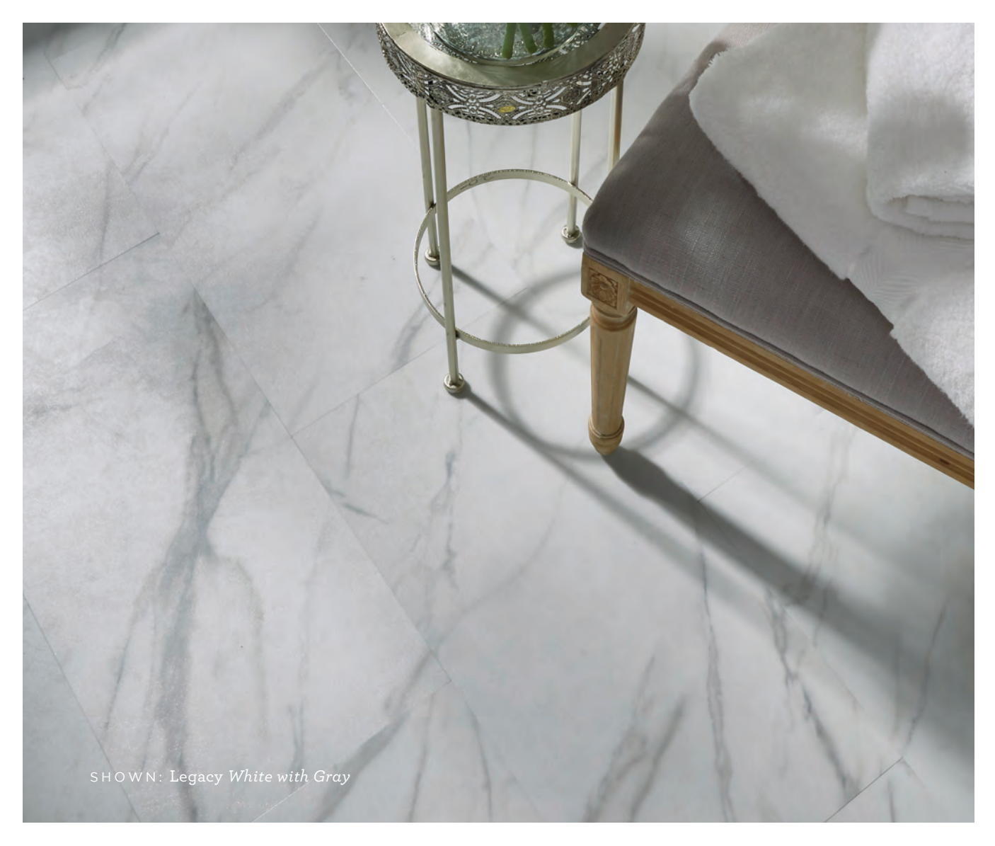
Legacy has a luxurious marble look with dramatic blue-grey veining that captures the timeless beauty of Tuscan Carrara marble in a modern 12" \times 24" size.