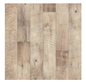
DOCKSIDE Sea Shell - MAX030