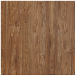
SUNDANCE Saddle - MAX002