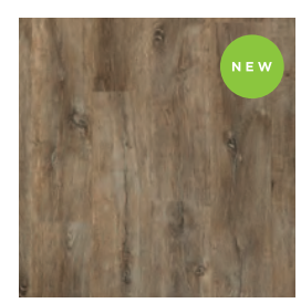
ASPEN Lodge - MAX082