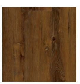
NAPA Tannin - MAXO61