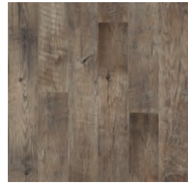
DOCKSIDE Driftwood - MAX032