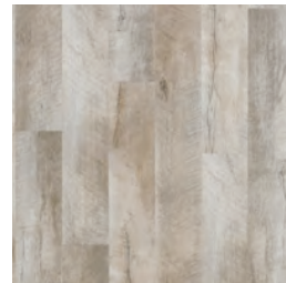
SEAPORT Sandpiper -MAX041