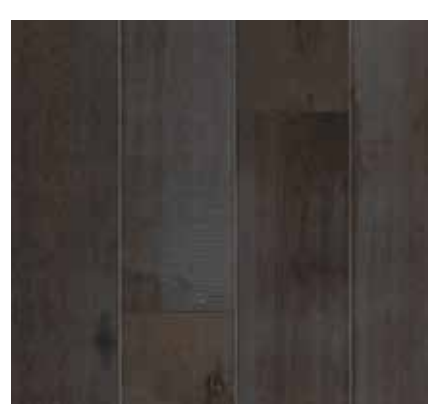
Artisan Collective<sup>™</sup>, Depth of Dark Gray, EAMAC75L402

*Armstrong Flooring Engineered Hardwood tested in accordance with ASTM E 84 and approved for Residential and Class C Commercial uses. Class C = 76 - 200 Flame Spread. Excludes TimberBrushed™, Artesian Hand Tooled™ and Rustic Accents™ Hardwood.