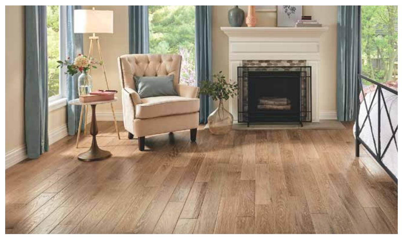
APPALACHIAN RIDGE<sup>™</sup> | Natural Attraction - SAKAR59L402X