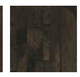
Dark Sky SAHTCM9L405