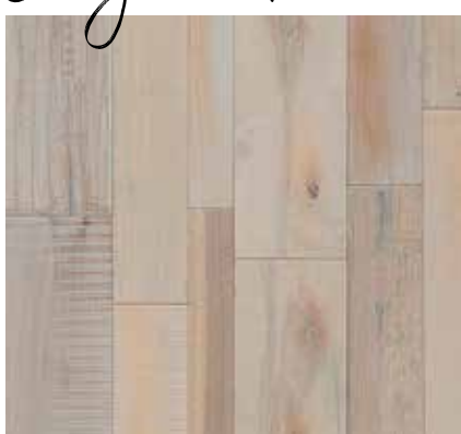
Woodland Relics<sup>™</sup>, Sea Sand Sky, EAXWRM5L401X