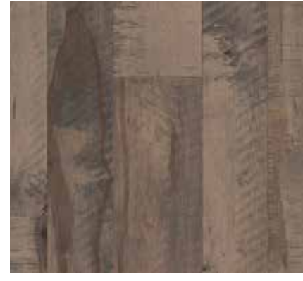
TimberCuts<sup>™</sup>, Gray Timber, EAMTCM5L401