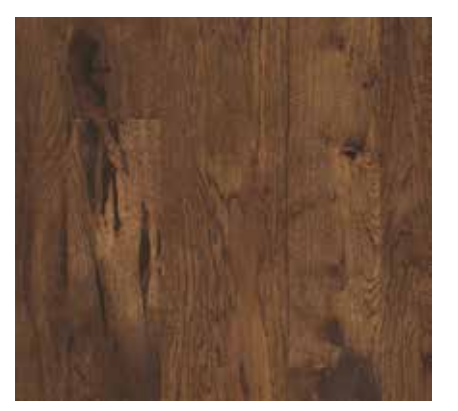
TimberCuts, Harvest Field, EAHTCM5L402